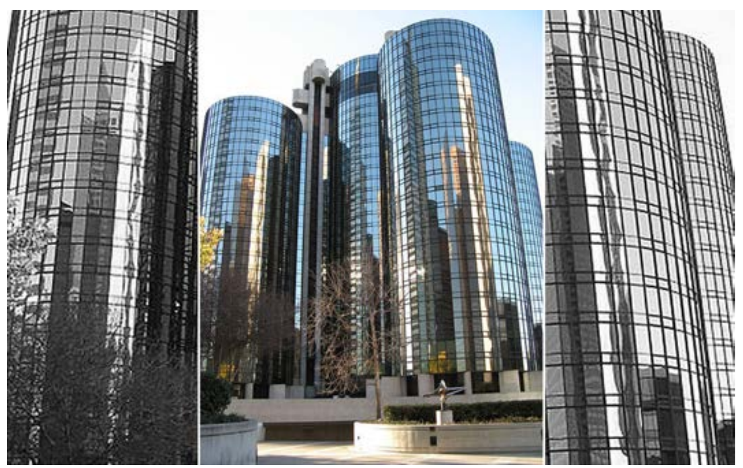
Westin Bonaventure Hotel & Suites, Los Angeles 404 S. Figueroa St., Los Angeles (Wikipedia)

"Everyone's favorite 'worst' building, due to its cavernous interior space and somewhat an example of brutalist architecture on the exterior. Viewed from a distance, the round tower forms accomplish one goal — a postcard picture of DTLA.