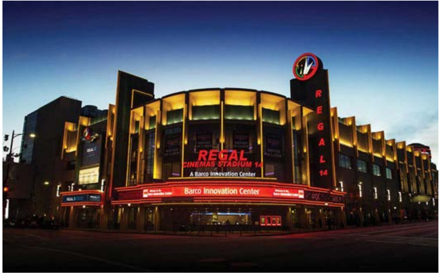
Regal LA Live, 1000 W. Olympic Blvd., Los Angeles

"It was built at the same time as the Ritz Carlton tower, which is a beautiful tower. Then there's this weird, clunky movie theater that is very prominent from the freeway. I never understood. Why is this revivalistic movie theater next to this beautiful shining sculpture? I've seen movies there. It feels cut off from the other components of LA Live. It's an awkward gesture."