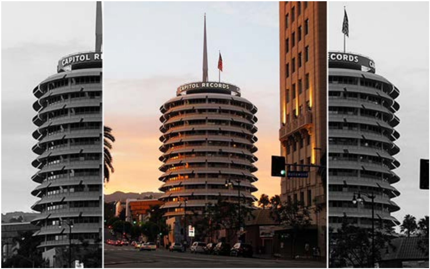
Capitol Records Building, 1750 Vine St, Los Angeles (Wikipedia)

"It was the world's first round office tower. It was built in 1956. It's pretty obvious what it is trying to be. But it works well. It's an office building that centers around the music industry. It looks like a stack of records. It looks great from the street and great when you are sitting inside by a window. It has fabulous views."