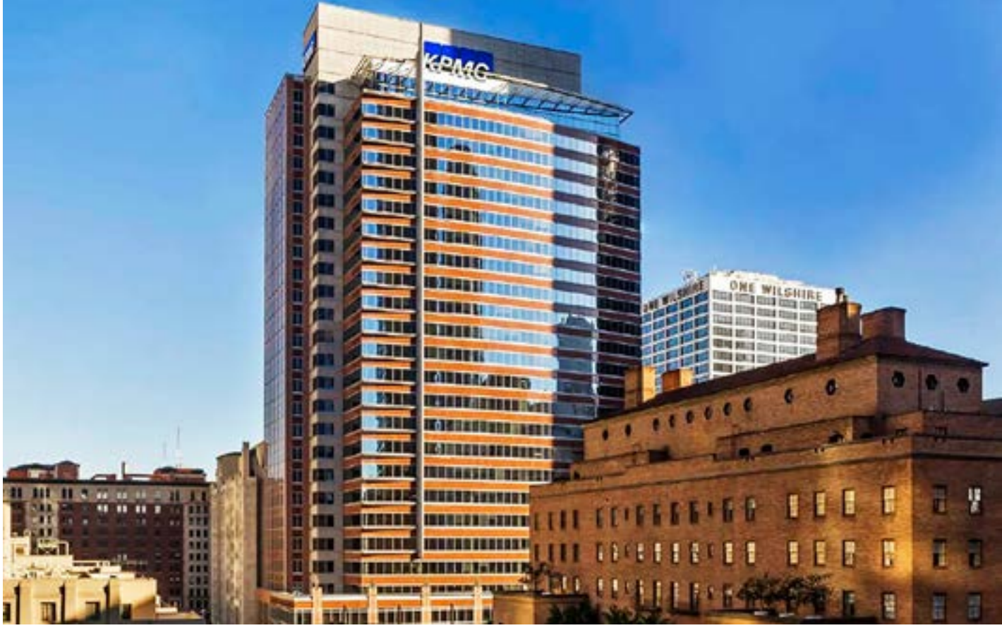
KPMG Center, 550 S. Hope St, Los Angeles (DowntownLA.com)

"Los Angeles Just a gorgeous and formidable design which graces Hope Street and stands out as the last building at the terminus of Hope Street at the Downtown LA Library. It's a 'contextual building' that responds to its neighborhood with understated style across from the classic California Club. It is beautifully articulated on the ground floor with an elegant tall lobby opening directly to Hope Street in fully expressed steel, glass and granite.