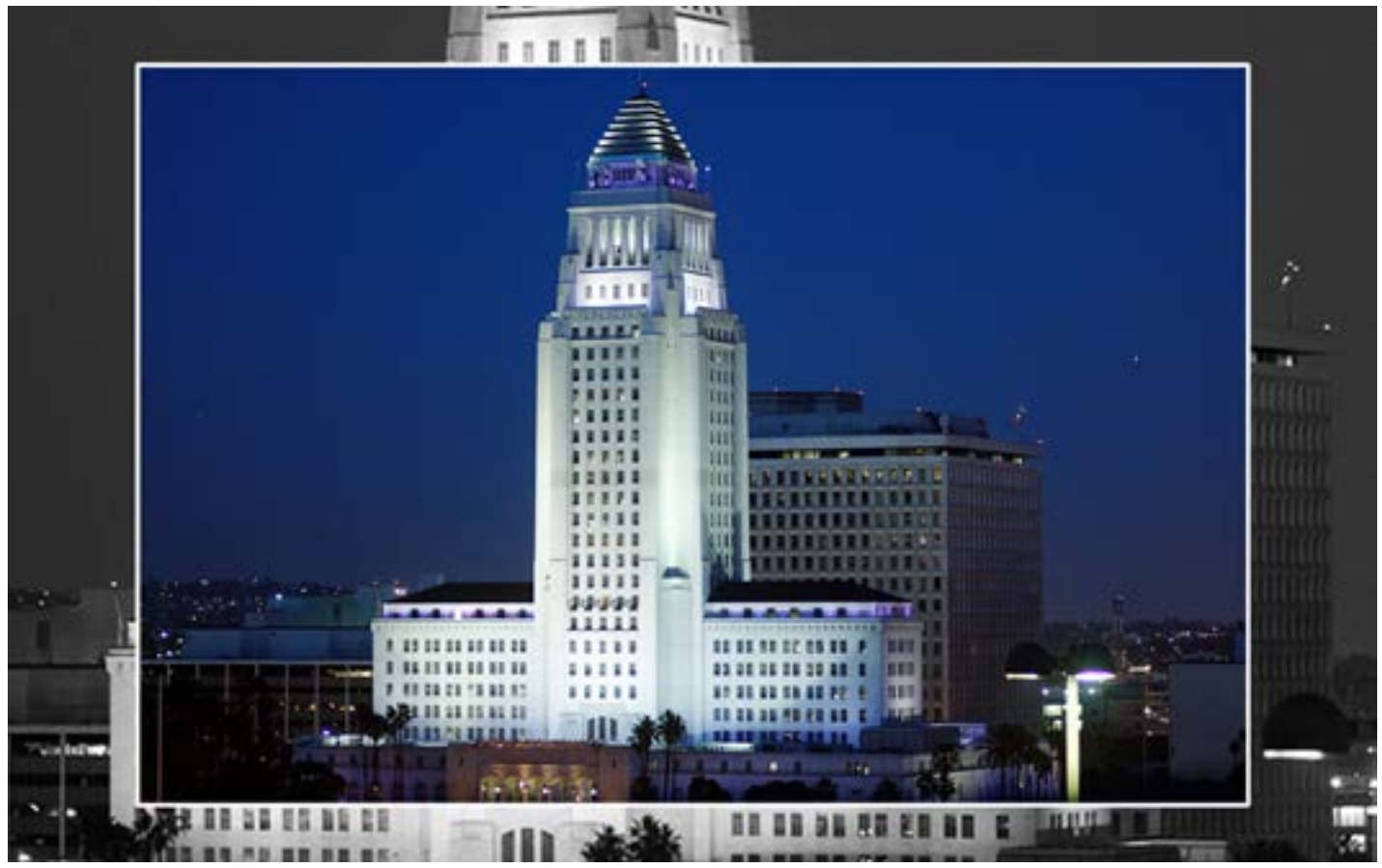
Los Angeles City Hall, 200 N. Spring St., Los Angeles

Los Angeles City Hall, 200 N. Spring St., Los Angeles