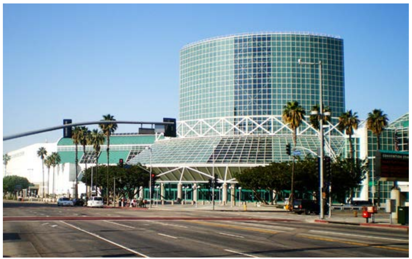
Los Angeles Convention Center 1201 S. Figueroa St., Los Angeles

"It is bland, drab and not suited to Los Angeles' extroverted personality. It doesn't take advantage of the weather and the climate. It barely connects to the city, let alone celebrate community. It should have been so much more."