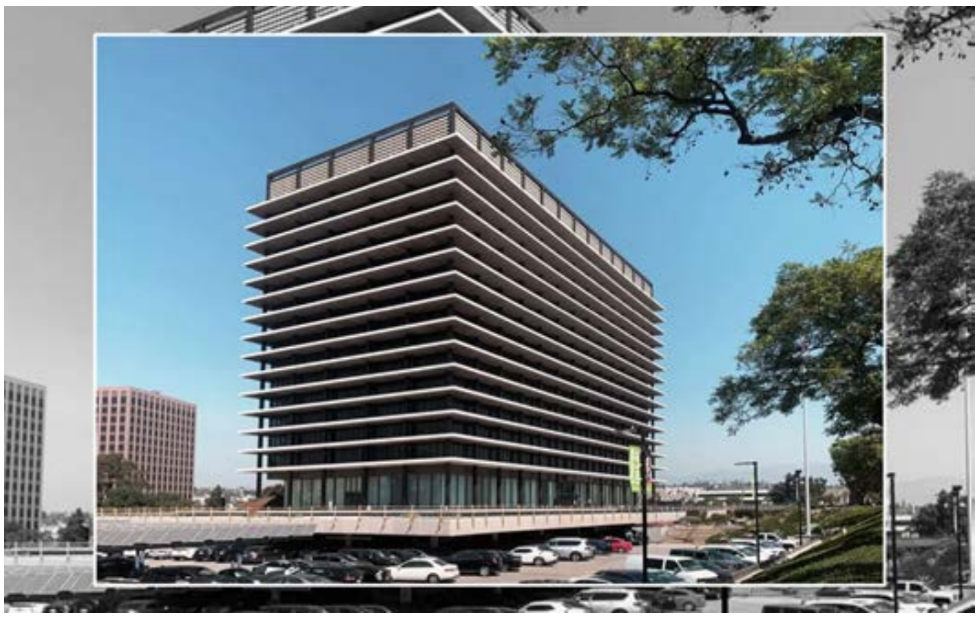
Los Angeles Department of Water and Power Headquarters / John Ferraro Building, 111 N. Hope Street, Los Angeles

"It is a truly iconic building. The first time I saw this building, I was 17 years old when I came to Los Angeles to submit my application to USC School of Architecture. The moment I saw this building, I knew I was in the right city to study architecture. It's a giant beacon of light and optimism for the city at night. The International style building's glass façade glows as it rises from a reflecting pool at its base. During the day the fountains rise up and around the building. It communicates a fascination with bringing water and power to a city bursting with growth and innovation. My 17-year old self had no idea she would be working for the firm that designed it!"