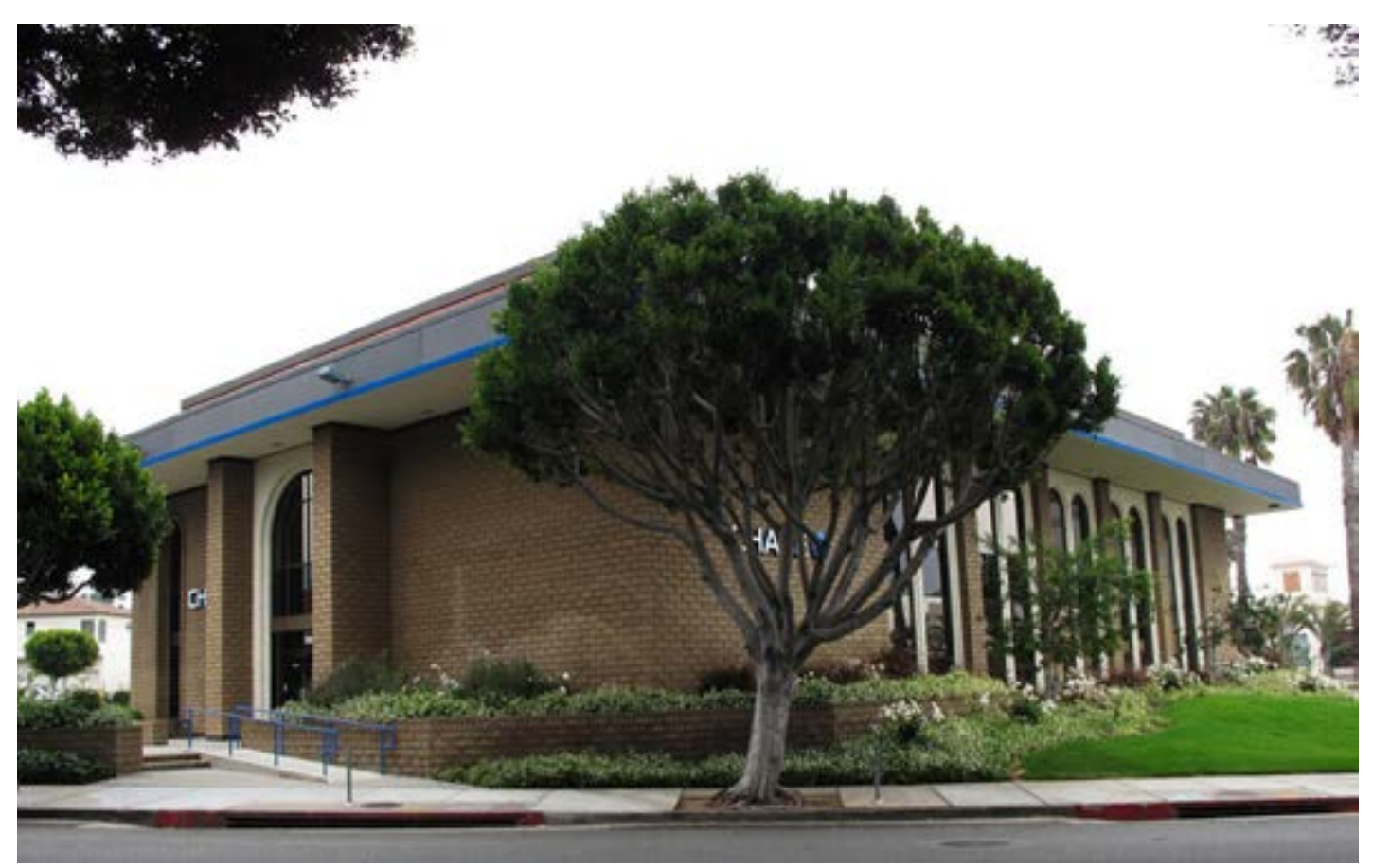
2711 Wilshire Blvd., Santa Monica (Google Maps)

"I've appreciated not liking this for some time. Set on a diagonal, no part of the building is normal to Wilshire Boulevard or its cross street. In other words, no element of the building is geometrically resolved to the rectilinear street block that it exists within. As a result, each time I go down Wilshire past this block, a sense of disruption occurs from the sheer discontinuity — just by driving by it. As architects, we almost always work to contextualize the form of our buildings to their environment, however this one in the name of monumentality, does not."