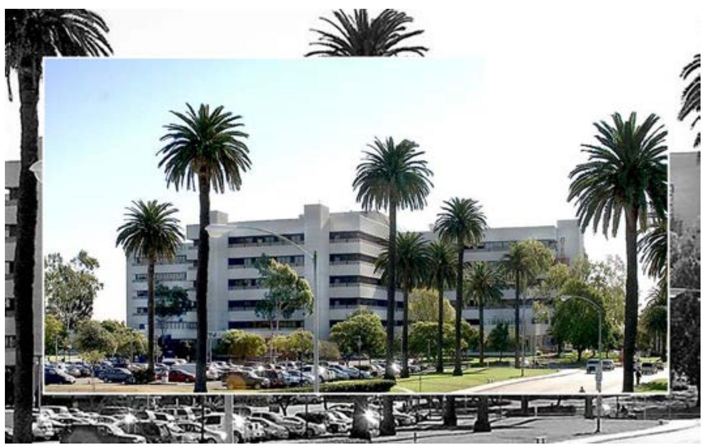
West LA Veterans Administration Medical Center, 11301 Wilshire Blvd., Los Angeles

West LA Veterans Administration Medical Center, 11301 Wilshire Blvd., Los Angeles