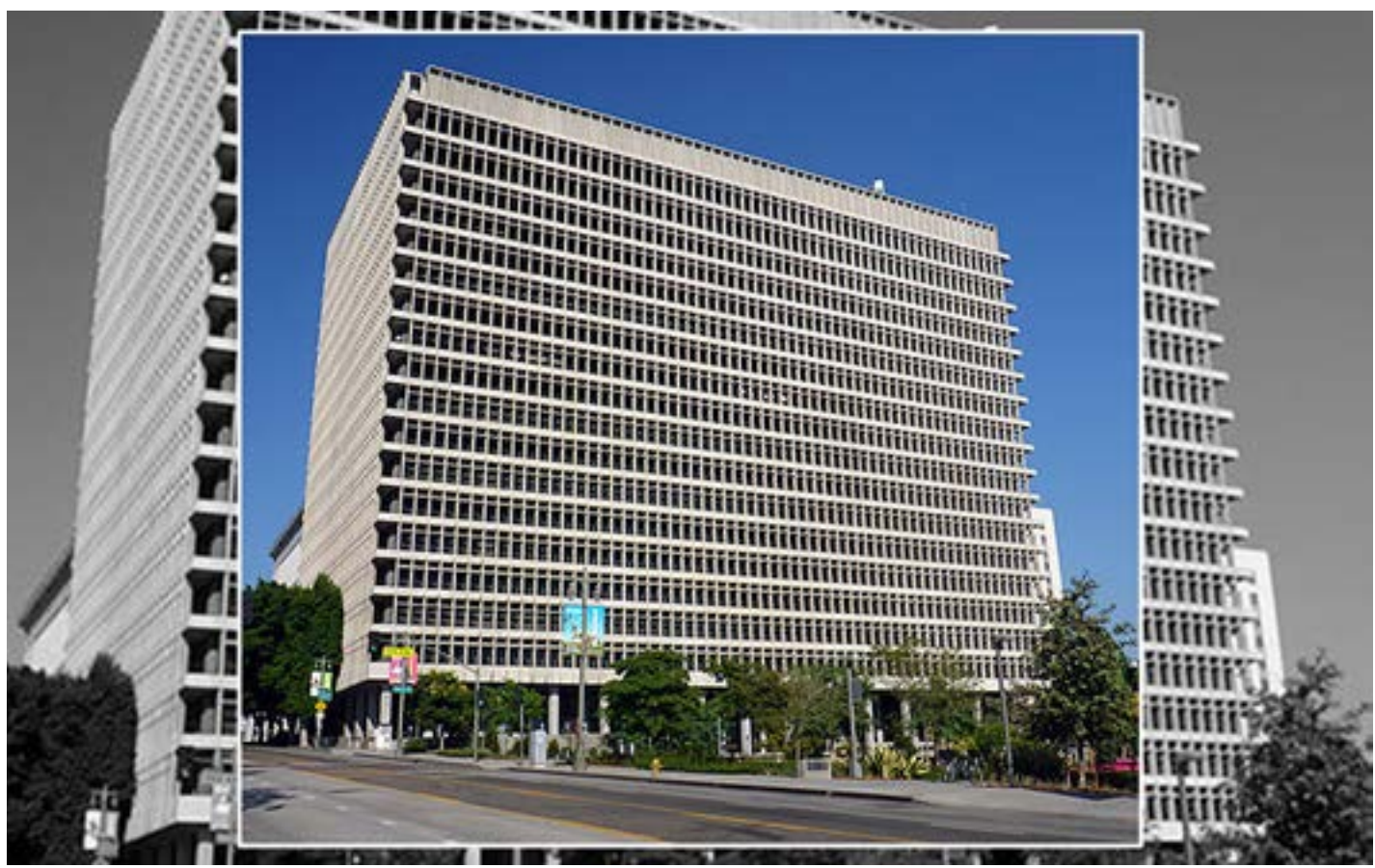
Clara Shortridge Foltz Criminal Justice Center, 210 W Temple St., Los Angeles

Clara Shortridge Foltz Criminal Justice Center, 210 W Temple St., Los Angeles