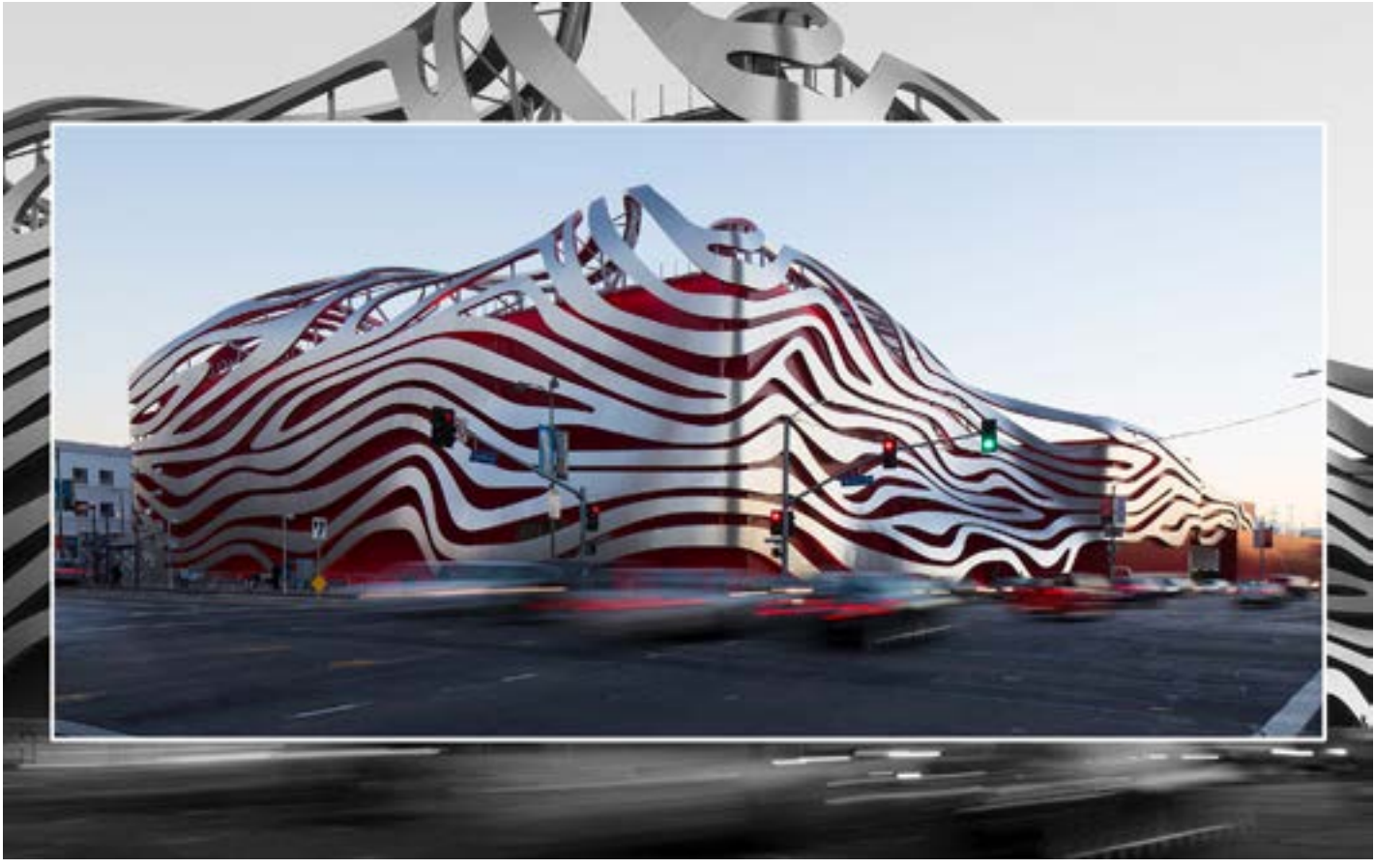
Petersen Automotive Museum, 6060 Wilshire Blvd. Los Angeles

"The most important thing (architects Kohn Pederson Fox) did was come up with an extraordinary design, to 'decorate a windowless box.' In doing so they brilliantly used the box as backdrop for an overlay of horizontal ribbons of steel reforming the mass of the building. It's very LA! It gives a whole new reason to go there, even if you don't like cars."