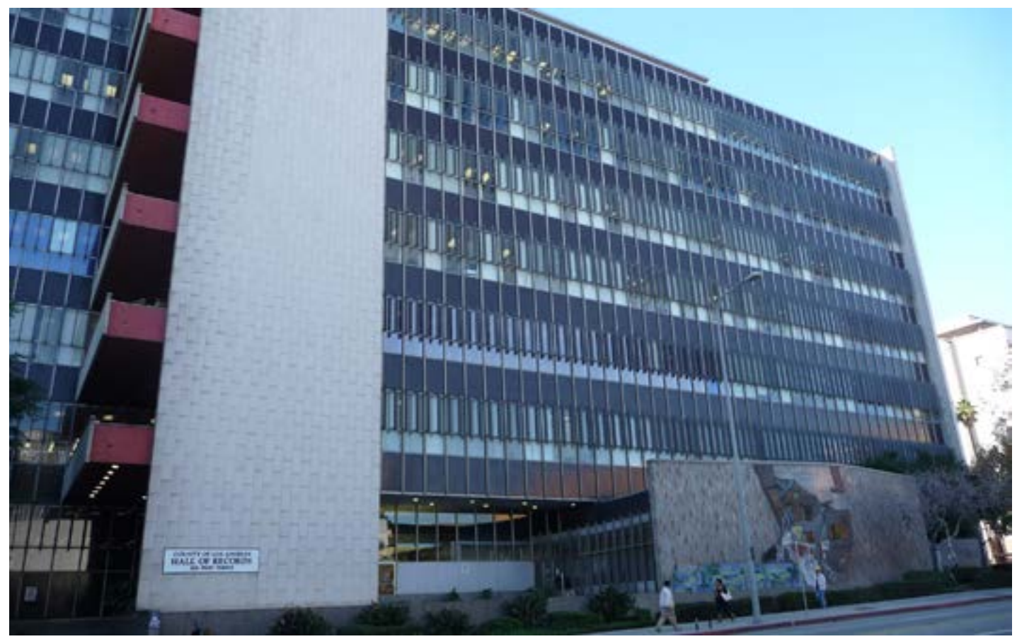
LA County Hall of Records 320 W. Temple St., Los Angeles (LAConservancy.net)

"Richard Neutra designed this building. He is such an interesting guy, He was thinking about sustainable design decades before others were thinking of sustainable design. What impresses me so much about the building is the way it is laid out in relation to the sun. It's got these big brise soleils that are constructed like airplane wings and shade the southern side of the building, which is all glass. Originally, these giant sunscreens pivoted with the sun to maximize shade. Neutra nailed the depth of the floorplate and height of the windows and ceilings to maximize natural light. In 1920s office buildings, they would lay out floor plans in the shape of an 'E', so that sunlight can get all the way into the rooms. As you start looking into the Hall of Records, he laid them the floorplate, windows and ceiling perfectly to get the most natural light. It's not super obvious at first glance. It took me a year of studying the building to appreciate it."