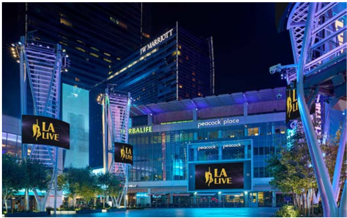
L.A. Live, 800 W. Olympic Blvd, Los Angeles

"It's the biggest urban error I've seen in 20 years in Los Angeles. How often are you able to pull together theater, food, sporting events, and a museum for the same project? How often do you get the opportunity to invite the city in? Walking along the street you don't see anything that tells you have arrived. It is an urban space that is only alive when people are standing in lines to enter a concert or sports event. There is nothing that draws you into the plaza space. There is no there, there. These older buildings I'm talking about celebrate entry, you know exactly where the front door is and that you have arrived."