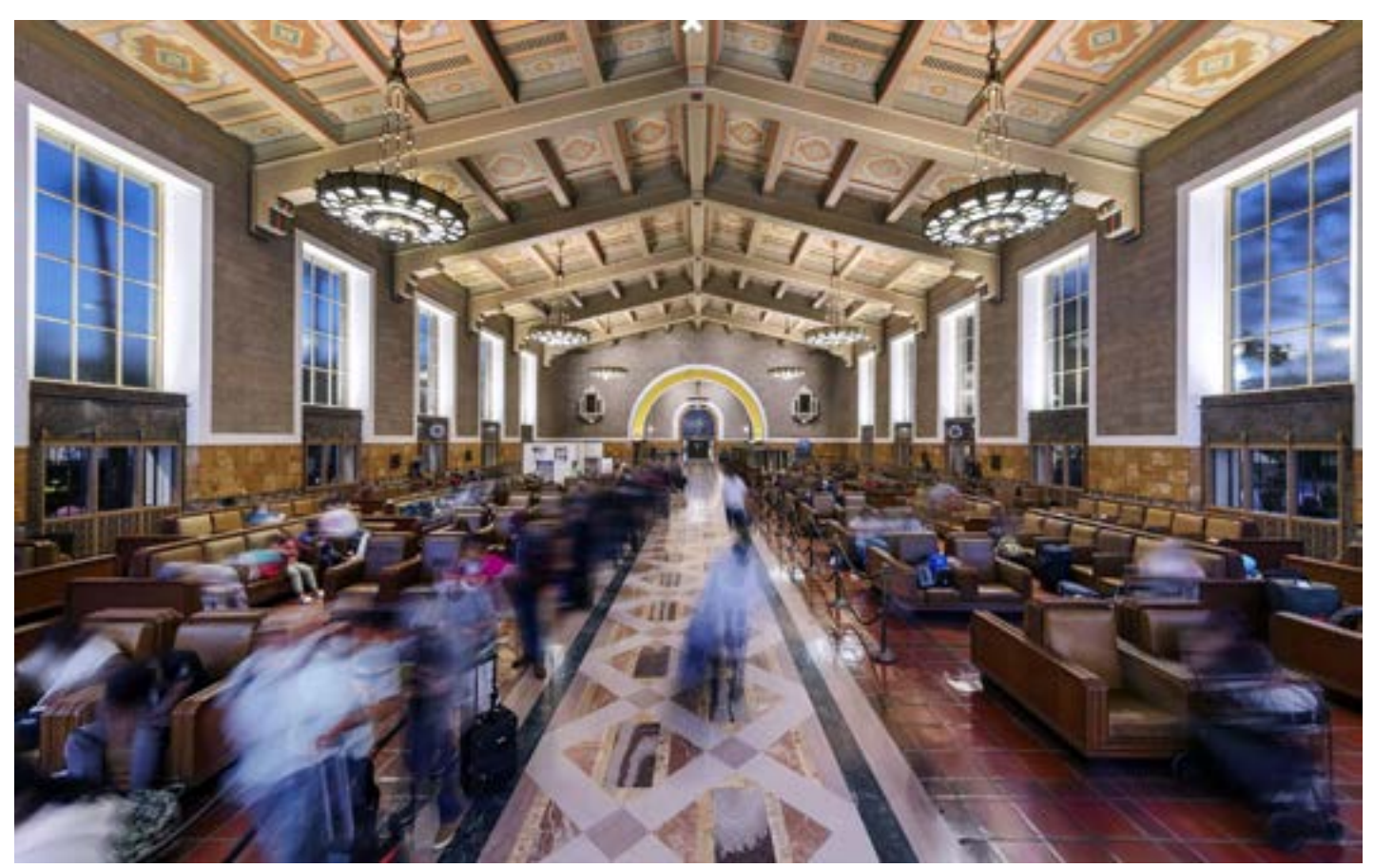
Union Station, 800 N. Alameda, Los Angeles (unionstationla.com)

"It is a building that has stood the test of time as an arrival portal and a gathering space for the city. I love its open courtyards where you can wander in and out while you are waiting for a friend to arrive or for your train to depart. People used to dress up for travel and dine in the restaurant before departure. At that time, there was an elegance to travel, which has always attracted me to train stations.