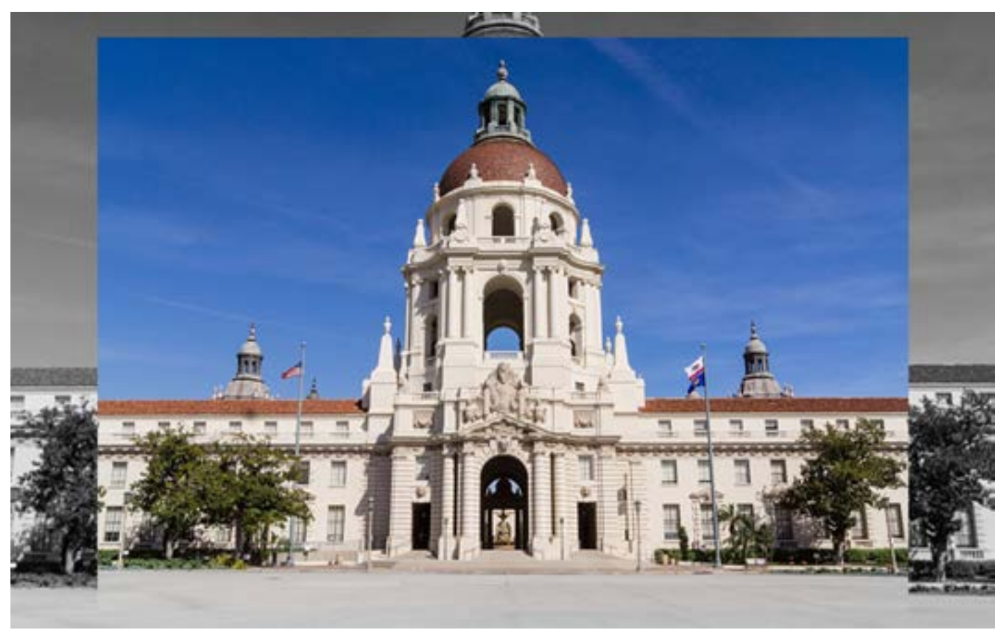
Pasadena City Hall, 100 Garfield Ave., Pasadena

"It's an amazing Spanish and Mediterranean Revival-style building with courtyards, colonnades, and a big rotunda. It's an imposing and inviting front door for Pasadena. I keep on talking about buildings that are part of our urban architecture. Buildings that invite people in — I admire that. We have such amazing weather here; we can be outside and celebrate that. But there's something about a building that cloisters you when you are outside in a courtyard and creates public space. I love spaces that are covered like a portico. It allows you to duck in and cool off when it is hot."