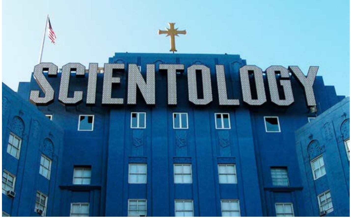
Church of Scientology, 6331 Hollywood Blvd. Los Angeles

"This building was one of the original Cedars-Sinai hospital buildings, it had a lot of civic gravitas. The building had arms that opened up and welcomed you, almost taking you in to take care of you. Now there's a big, steel, 10-foot high fence around it and strange little pavilions that were added.